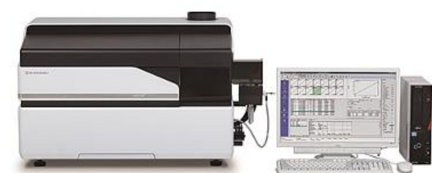
Figure 1: ICPMS-2030

Food safety may occur in food planting, processing and packaging. It has drawn great concerns due to air and soil pollution, environmental contamination and misuses of additives and materials in food processing and other human activities. Metal toxicity can be acute or chronic, depending upon one's dietary intake and duration of exposure. Toxic elements such as As, Cd, Pb and Tl are well known as they are among the most hazardous materials present in food chain based on their prevalence and the severity of their toxicity. Even at low concentration, these heavy metals could be potential threats to human health. Cr, Ni, Se are either required for plant growth or considered as essential micronutrient elements. However, they would become toxic at high concentrations. The determination of trace level metals in food is critical for food safety and human health [1, 2]. Among various techniques for heavy metal analysis, ICP-MS is the most ideal and reliable technique for measuring toxic elements in food due to its superior low detection limit, high throughput, wide linearity range and less interferences.